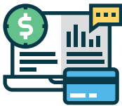
Production PO Processing