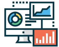
Electronic Data Interchange (EDI) Processing

We have invested in our global delivery model and leverage our talent and decades of experience in all phases of supply chain management, which allows us to seamlessly execute the day-to-day operations where needed the most to support your growth and scalability.