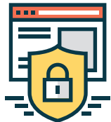
Master Data Management