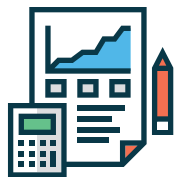
Reporting & Insights